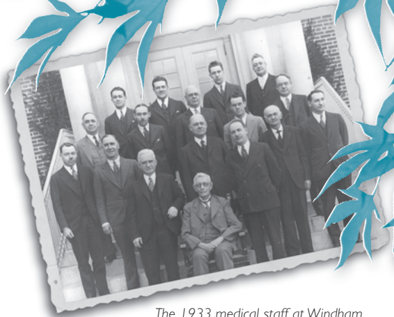
The 1933 medical staff at Windham Community Memorial Hospital consisted of seventeen physicians who had previously practiced at St. Joseph Hospital.