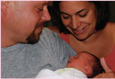
Childbirth education is just one of many services Windham Hospital offers for new parents.

Especially during times of financial or personal stress, it is reassuring to know that there are very special staff members and programs at Windham Hospital that are here for you in times of need. We educate patients about how to care for themselves, provide preventative health information to