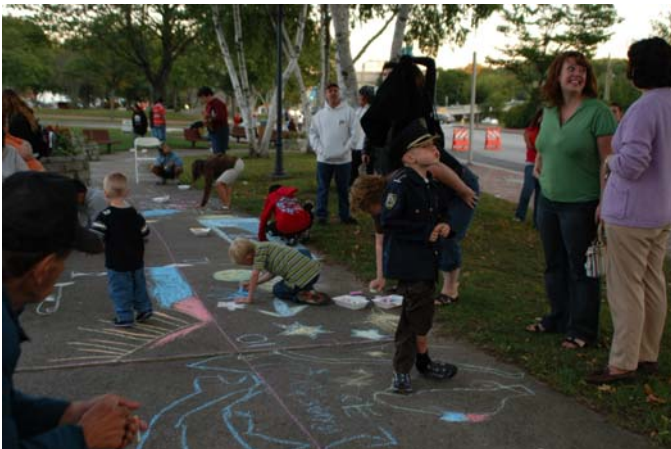
The Chalk Festival got off to a great start!

Contestants in the Chalk Festival drew on the Jillson sidewalks; our winners received $25 gift certificates from The Lily Pad, to help them continue their artistic pursuits!